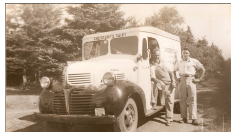
Jim Chesebro and Jerry Hyson pose next to Chesebro Dairy delivery truck

From the small, one or two cows in the yard, to larger milk operations, suppliers employed horse carts to dories to provide milk to all, mainland or island. Stop by to see the photos, dairy artifacts, and farm implements or to leave your own dairy remembrance in our memory book.