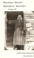
Sketches Volume III