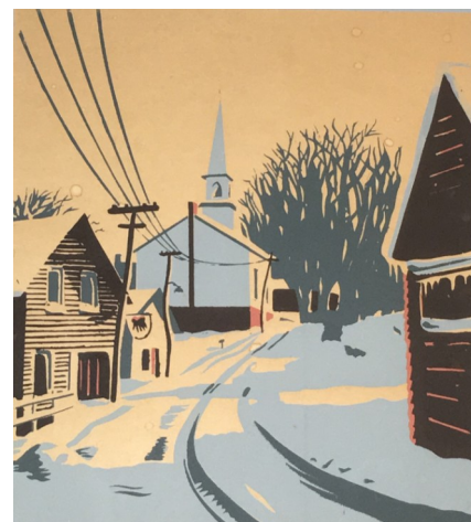
"East Boothbay, Maine" by Rockwell Livingston

Looking for a gift? Be sure to check out the items on our holiday sale table. Choose from a wide variety of books on general local history, fishing, boatbuilding, the ice industry, magnets and commemorative coins, historical maps and photographs, and more. There may even be a few surprises. Purchases of $15 or more include a free gift bag, while supplies last. The society's open house is open to all. Please join us!