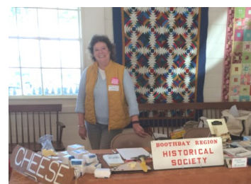
Cheese for Sale!

and especially to Stephanie Hawke and Hawke Motors for furnishing us with such a perfect location—with parking! See you in 2017.