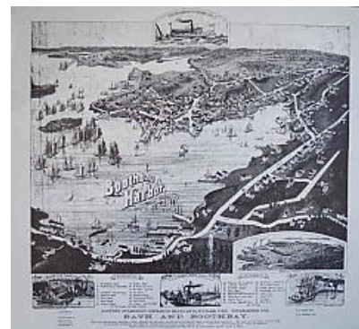
1885 Map of Boothbay Harbor