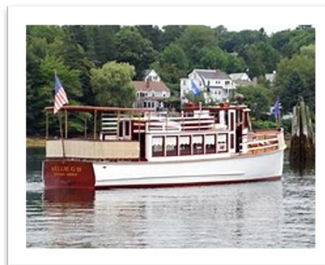
Nellie G II