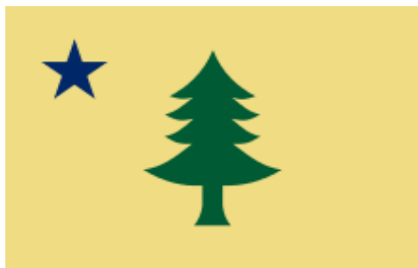
1901 Maine State Flag

BOOTHBAY REGION HISTORICAL SOCIETY P.O. Box 272, 72 Oak Street Boothbay Harbor, ME 04538-0272