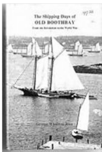
Shipping Days of Old Boothbay by George W. Rice $45.00 plus tax