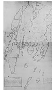
1815 Rose Map with key to land-owners. 18'x33' $7.00 plus tax