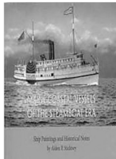
Maine Coastal Vessels of the Steamboat Era by Alden Stickney $24.00 plus tax