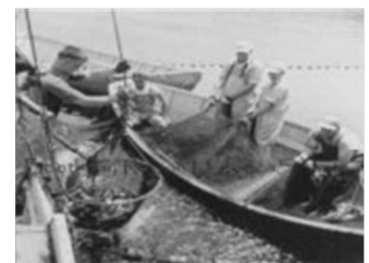
Dory fishing for mackerel.

Please make an appointment to view our large collection of historical photographs