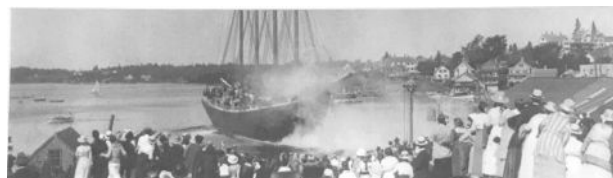
Launch of the James E. Newsom 1919