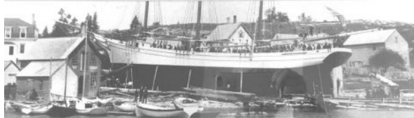
Lillian Woodruff 1889

In conjunction with our exhibit "Captains and Vessels of the Boothbay Region 1800 to 1921" we are raffling two magnificent black & white 25"x9" matted and framed photographs of vessels built in the Boothbay region: the James E. Newsom and the Lillian Woodruff . Tickets for these separate raffles may be purchased in person at the historical society, from any trustee, or by sending a check payable to BRHS: $2 each, six for $10. Two winners will be drawn Saturday, August 27th.