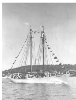
Leaving Boothbay Harbor, 1921

From our artifact collection: This leather-covered club known as a blackjack was carried by Walter Kilton when serving as mate on different vessels. Weighted at one end, blackjacks were used as handy tools to keep sailors in line, especially on long voyages where boredom might lead to unrest or laziness.