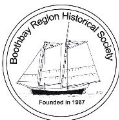
Our new logo!

Great Works Internet (GWI) offers a subsidized service free of charge to non-profit organizations. Thank you to GWI for generously providing BRHS with an email account.