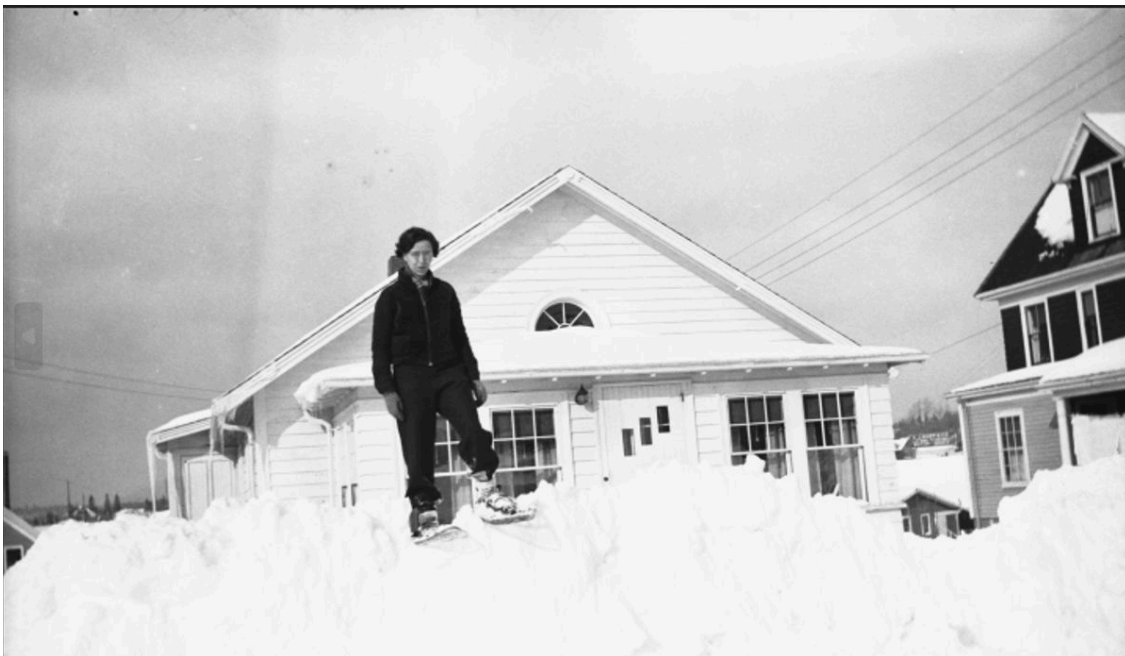
An unidentified woman on a snowbank, undated.

News & Events | Exhibits | Support | Visit Us