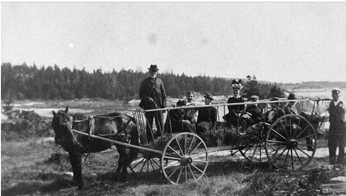
Group of unidentified people enjoying a ride in a hay wagon. Undated.

News & Events | Exhibits | Support | Visit Us