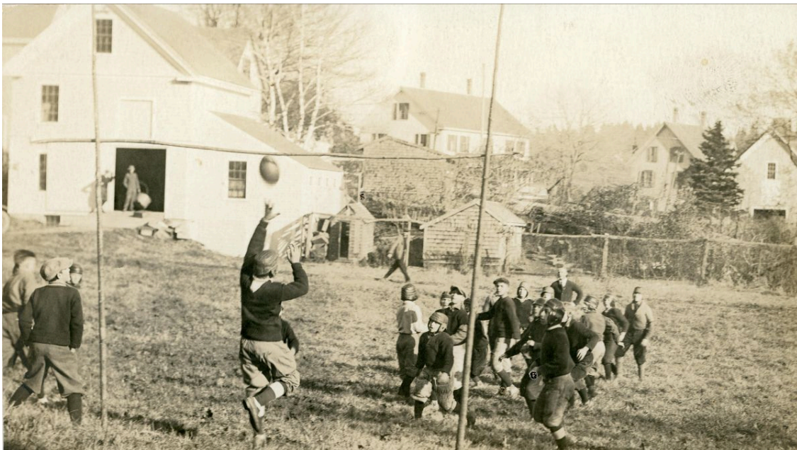
Early photo of boys playing football, looking northeast to Weymouth House.

News & Events | Exhibits | Support | Visit Us