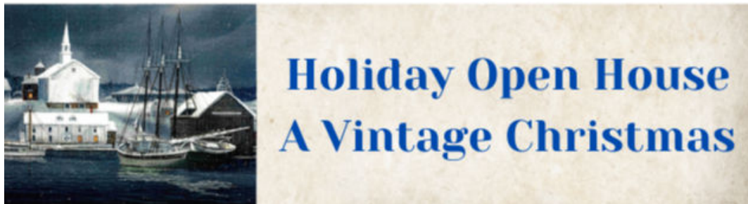
Earle Barlow's 1920's Scene of the Coal Wharf East Boothbay